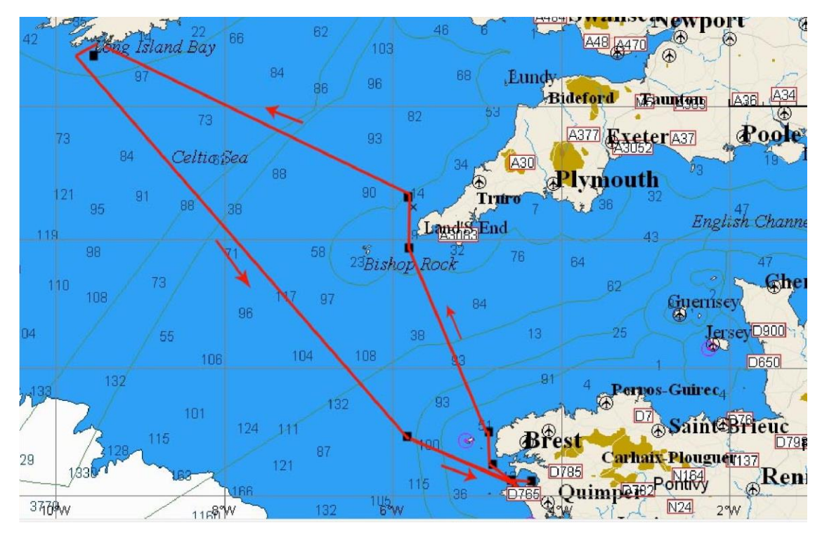
(Non contractual document)

Alternative courses are possible ; especially a South course towards the Gironde estuary (towards the former BXA marker, now a virtual 'aton' AIS BXA, in case of bad weather in the Celtic sea, see map below).